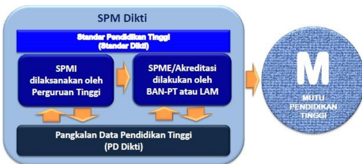
Picture 1. Higher Education Quality Assurance System

The higher education quality assurance system aims to ensure the fulfillment of higher education standards in a systemic and sustainable manner, so that a quality culture grows and develops. The Higher Education Quality Assurance System functions to control the implementation of higher education by tertiary institutions to realize quality higher education.