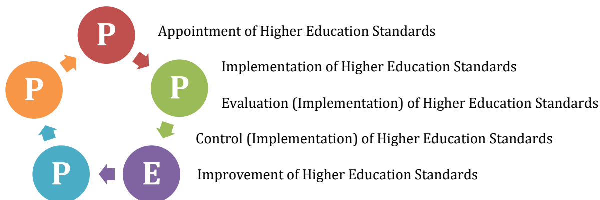
Figure 3. SPMI Mechanism